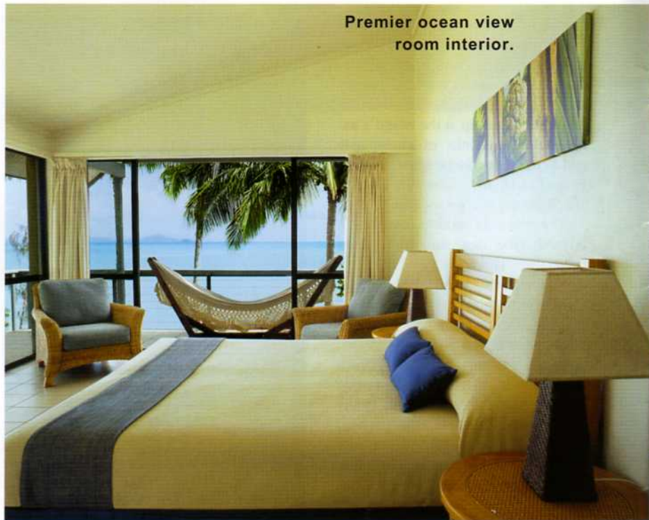
Premier ocean view room interior.

The views of the surrounding small islands were breathtaking and it was great to experience what you couldn't see on foot. The waves at one point were quite high and I was literally riding the waves deep out in the ocean and screaming from the thrill of it all as I was showered in water. The JetSki Safari is highly recommended and was truly one of